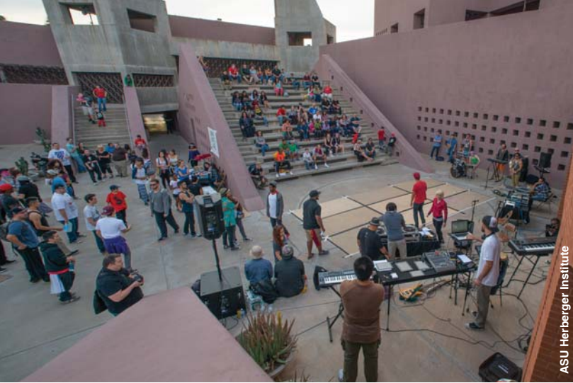
ASU Herberger Institute